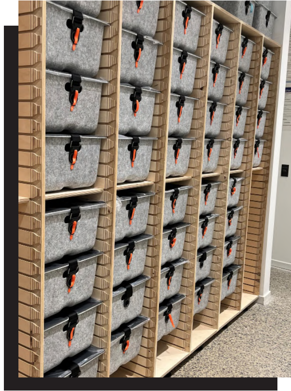
68" Tall Unit w/TOTem Enhanced (its 8 totes)