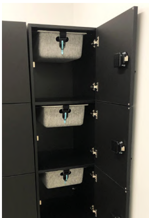
72" Tall Unit (fits 4 cubbies)

Typical steel or laminate locker = $500 per