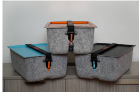
19.1" (l) x 13.5" (w) x 7.75" (h) Lid available in aluminium