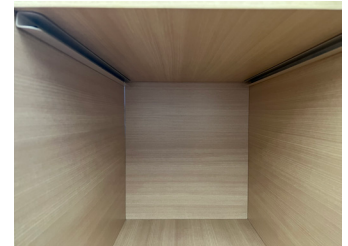
For use with desks with a 21" clearance underneath