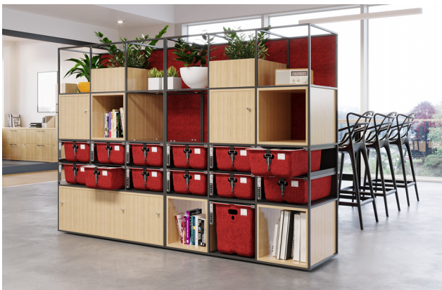
EVO Screen Option 1