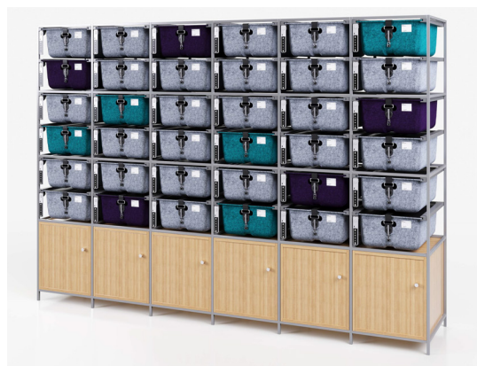
EVO Screen Option 2