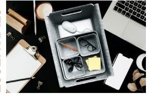
17.25" (l) x 12.75" (w) x 3.5" (h) 17.25" (l) x 12.75" (w) x 6" (h)