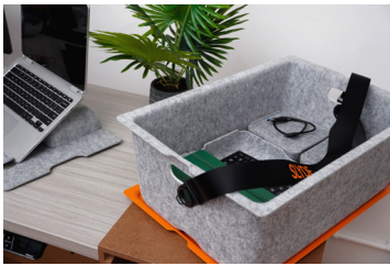
See SPEC GUIDE for all options

Optional Accessories include laptop riser, felt insert with phone charging lid, paper tray, shoulder strap & more!