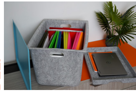
19" (l) x 13.5" (w) x 11.75" (h) Lid available in aluminium