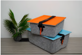
16.6" (l) x 12.7" (w) x 6" (h) Lid only available in felt