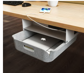
For use with desks with a support bar underneath